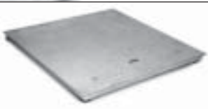
Shown with optional treadplate

(SEE CHART ON BACK OF PAGE FOR PART #'S)