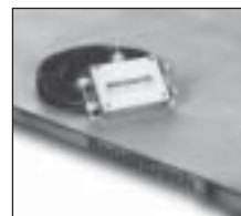
Remote EL604STA stainless steel NEMA 4X junction box with 20 ft of hostile environment load cell cable.