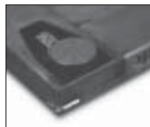
The load cells are recessed within the channel and protected on all sides. SUREFOOT™ supports provide a superior load introduction surface, reducing extraneous forces which might affect scale accuracy.

Access ramps and pit frames available. See price page FS-7 (P)