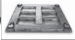
The 6" stainless steel channels provide superior protection for load cells and cable.

(SEE CHART ON BACK OF PAGE FOR PART #'S)