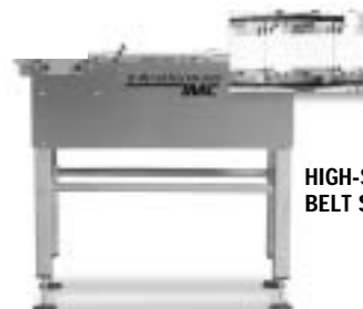
HIGH-SPEED BELT SYSTEM