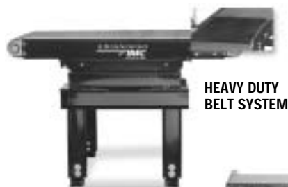
HEAVY DUTY BELT SYSTEM