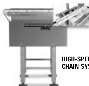
HIGH-SPEED CHAIN SYSTEM