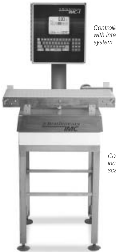
Controller shown with intermediate belt system