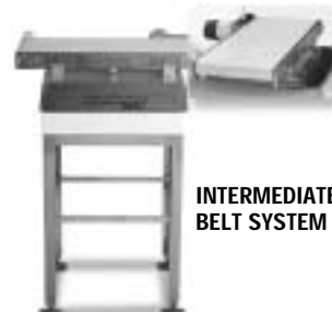
INTERMEDIATE BELT SYSTEM